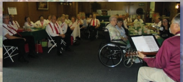
Forty Volunteers were served lunch at the Volunteer Appreciation Luncheon.